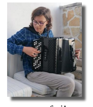
even on safari!